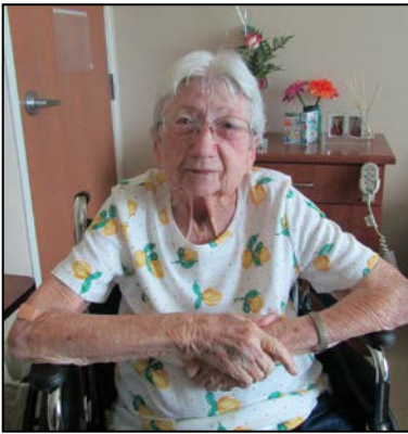
Resident of the Month