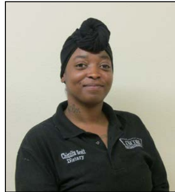
Employee of the Month