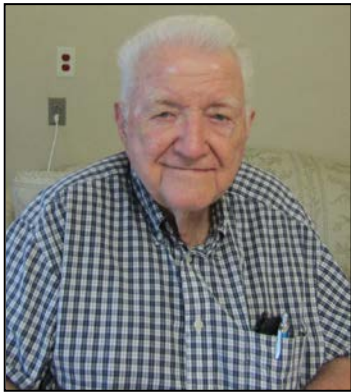
Resident of the Month