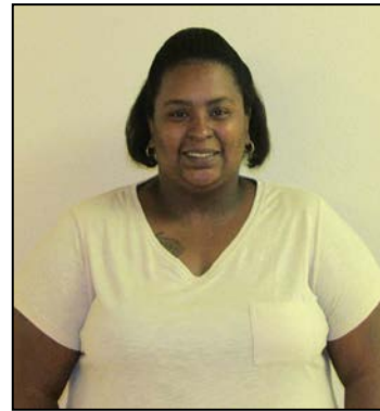
Employee of the Month